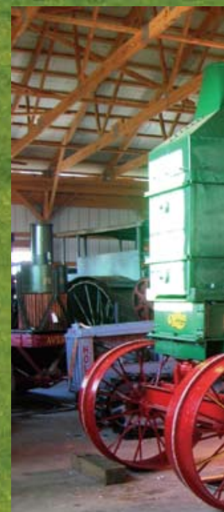
Inset photo shows one of Toplands’ antique tractors that will be on display. Background photo shows Scottish Highland cattle.

Connecticut Farmland Trust is the only private, statewide, nonprofit conservation organization dedicated exclusively to protecting Connecticut’s working farmland. For more information about the Trust and to see a list of preserved farms please visit www.ctfarmland.org .