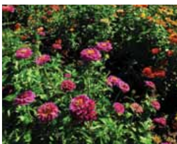
FLOWERS & HERBS

Daphne Yannakakis & Don Lareau 11466 3725 Road Paonia, CO 81428 (970) 527-3636 www.zephyrosfarmandgarden.com USDA-certified organic, open-pollinated vegetables and cut flowers for farmers' and local markets, and CSA shares available