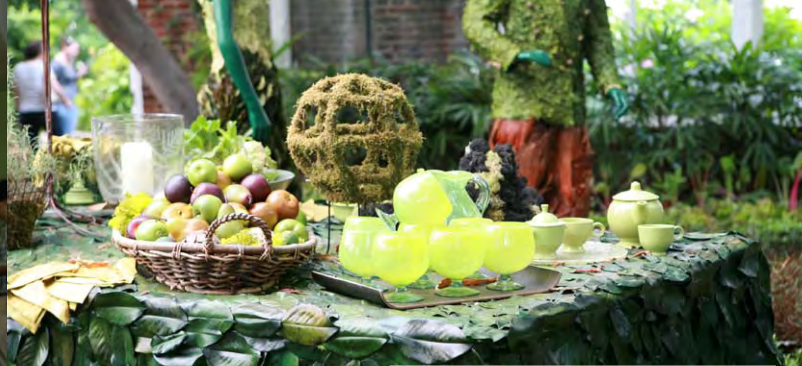
The South Conservatory is staged like a modern garden party to showcase the "farm to fork" initiative.

The café is housed inside the first LEED-certified visitor's center and