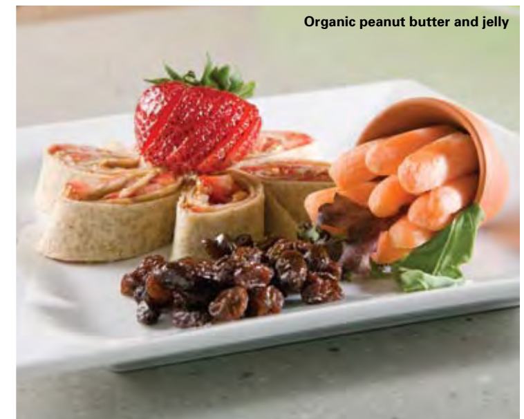
Organic peanut butter and jelly